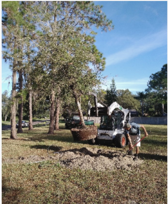
BABY OAK BEING PLANTED IN 2016

In 2016 the residents along Sussex Wy went together and purchased "Baby Oak" which is planted just north of Mama Oak behind a stand of pines. Hopefully as it grows it will be as graceful and a great place for photo opportunities.